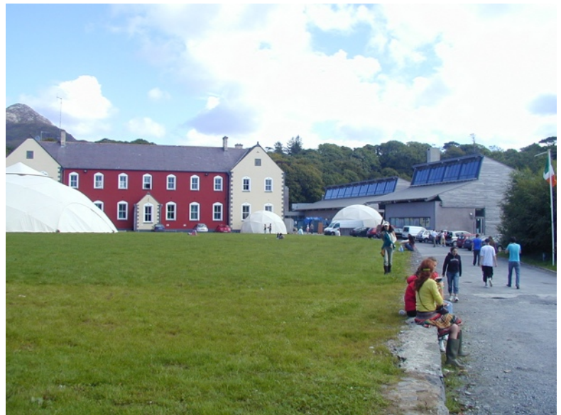
GMIT Furniture College in Letterfrack, Ireland.

Located in a small village in County Galway, GMIT Letterfrack enjoys a 95-97 percent completion rate for the classes in which its students enroll. The college began as a partnership between Connemara West, a community and rural development organization, and what was then a Regional Technical College. It was a development strategy for a community that had an unofficial unemployment rate of 50 percent and, with assistance from the Danish Technological Institute, was intended to help rescue a lagging furniture cluster. The college has since extended its partnerships to include universities and programs throughout the world. GMIT Letterfrack's strong reputation and relationships with employers in and outside of Ireland offer its students the chance to apply their education through internships, and to achieve successful post-graduate careers.